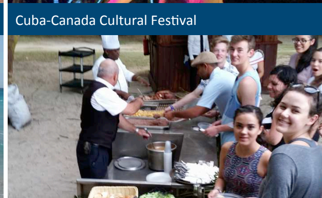
A Traditional Cuban Meal

DAY 1 – Check into our rooms at the University of Matanzas – right by the beach in Varadero! Our hosts will show us the hotel and area amenities. Perhaps it’s time to explore the beach?! After dinner, a presentation of the delegations.