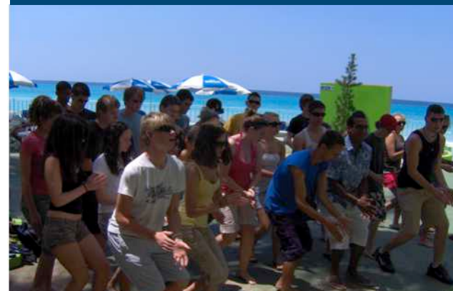
Cultural: Learning to Dance