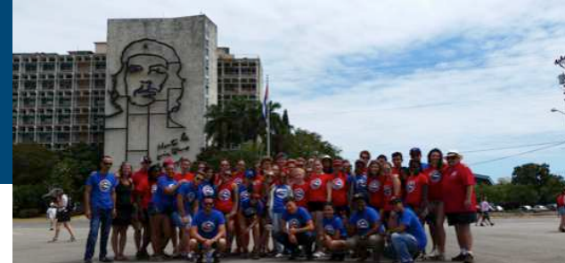
Tour: Havana’s Revolutionary Square

Becoming travelers = building friendships