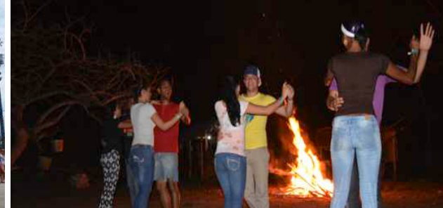
Cultural: Evening at the Plantation