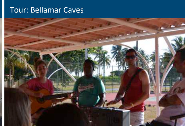
Cultural: Sharing Music