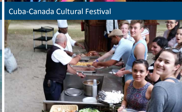
A Traditional Cuban Meal