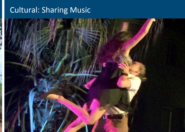
Cuba-Canada Cultural Festival