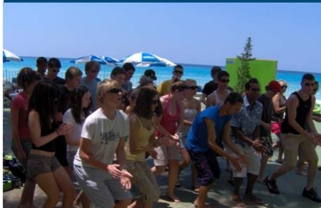
Cultural: Learning to Dance