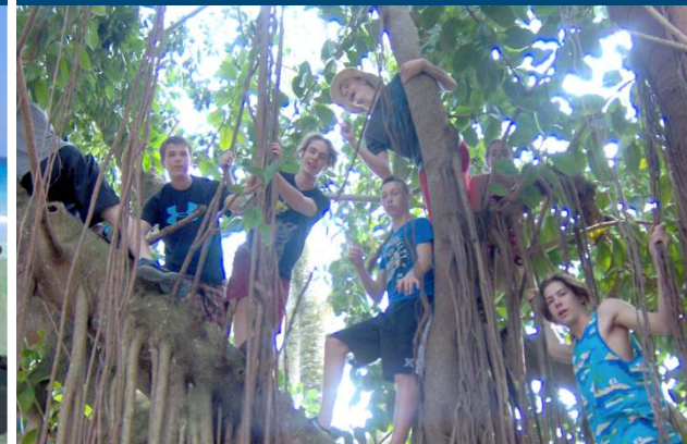
Tour: Bellamar Caves