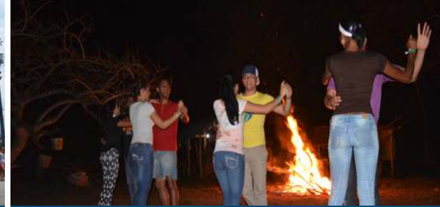
Cultural: Evening at the Plantation