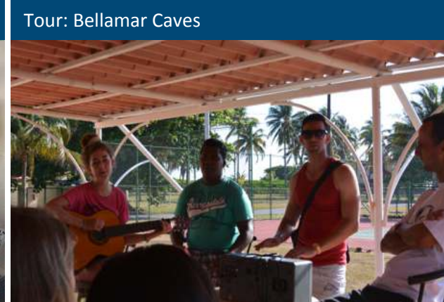
Cultural: Sharing Music