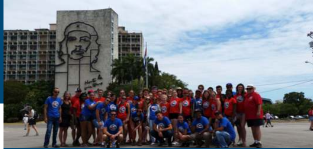
Tour: Havana's Revolutionary Square